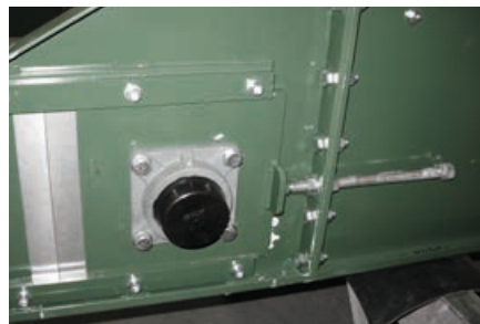
EASY TO MAINTAIN