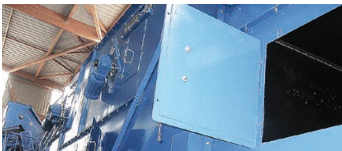
EASY TO MAINTAIN